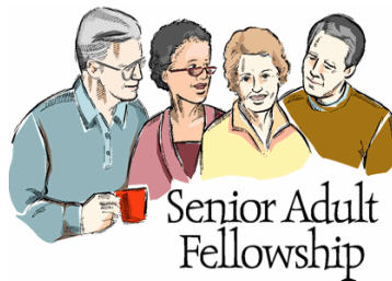
Senior Adult Fellowship